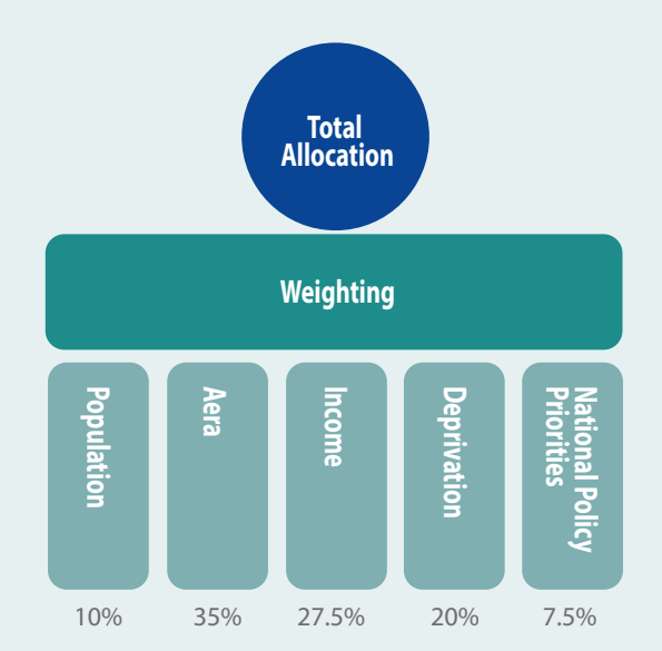
The equalisation mechanism: indicators and weightings used.

That this model is used to review local authority baselines every 5 years, following updated census data.